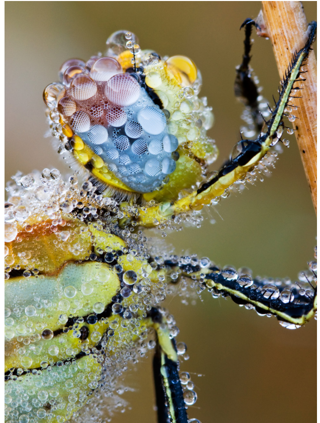
Red-vein-darter dragonfly